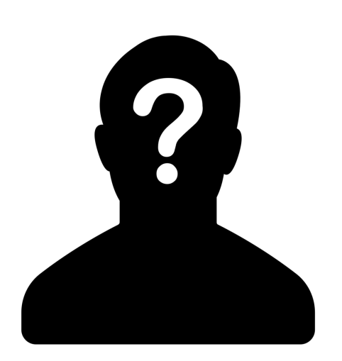
Vice-President (Position Vacant)